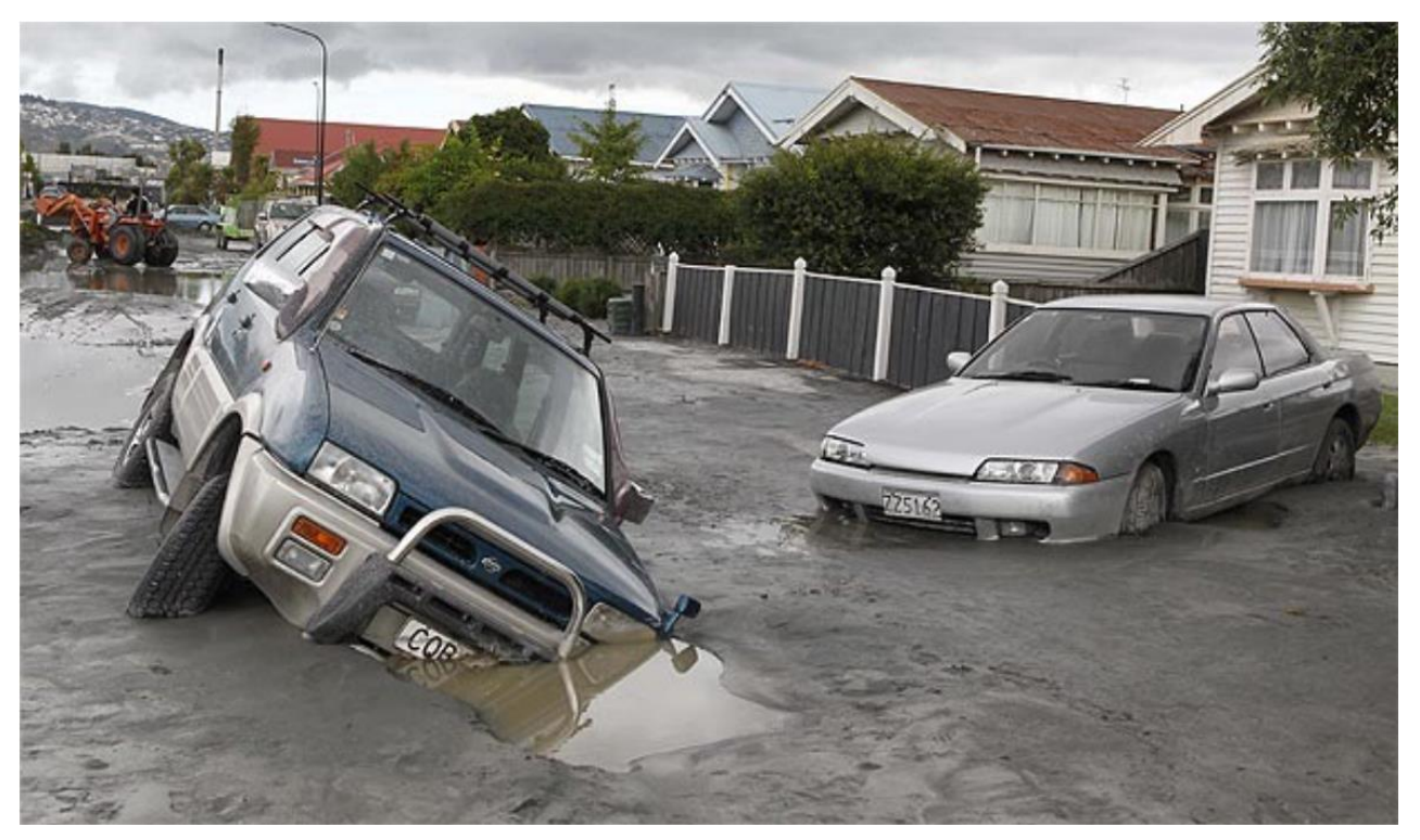
Living with Liquefaction http://temblor.net/earthquake-insights/living-with-liquefaction-part-1-514/

When walking on liquefied ground, extreme care must be taken. From one step to the next, you could be up to your waist, or worse. Houses sink into the earth, tip over and subside. After the quake, as the soil dries out, it turns to 'cement' and is difficult to dig through, increasing clean-up cost and time.